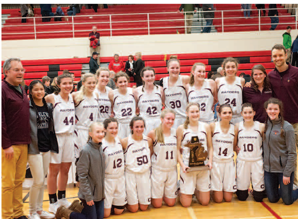
The 2018 Class C district champion, Charlevoix Rayders.